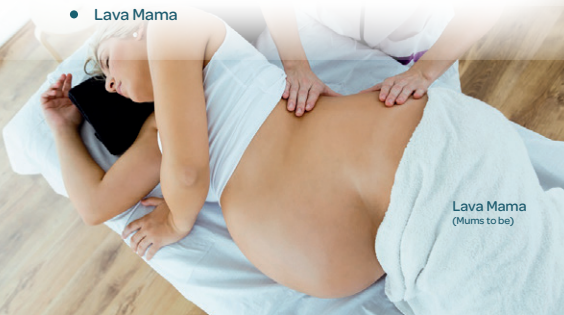
Lava Mama (Mums to be)