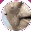
SKIN TAG REMOVAL